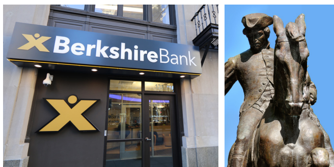
Flagship Boston branch on Congress Street adjacent to Post Office Square